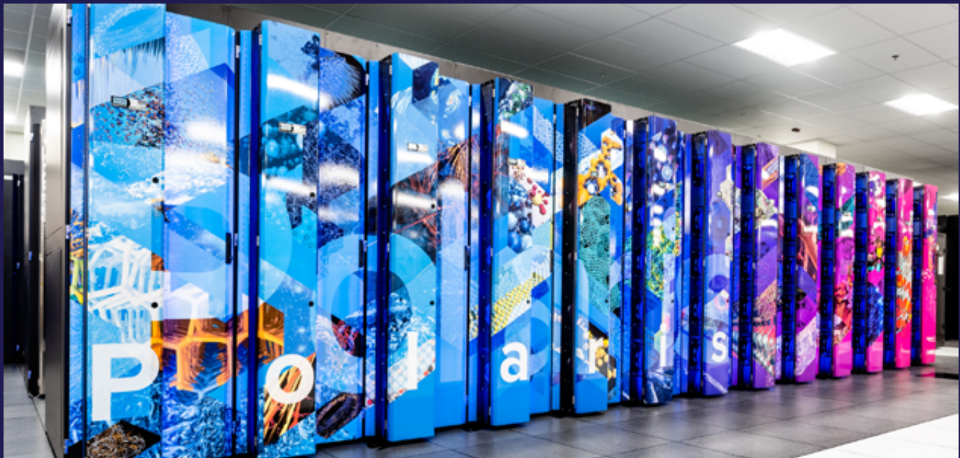
Polaris, a hybrid CPU-GPU system built by HPE, will help ready scientists for the arrival of the lab's Aurora exascale supercomputer.

Argonne National Laboratory's new supercomputing resource will accelerate efforts to prepare applications and workloads for Aurora.