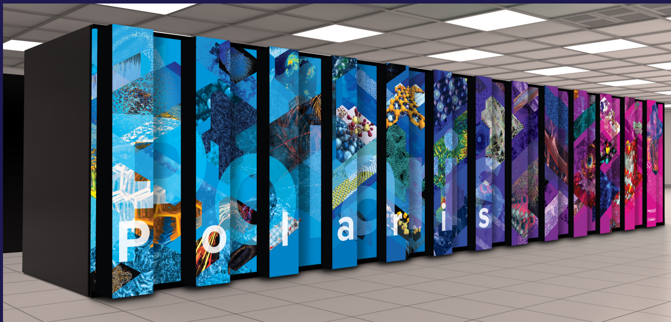
Polaris, a hybrid CPU-GPU system built by HPE, will help ready scientists for the arrival of the lab's Aurora exascale supercomputer.

Argonne National Laboratory's new testbed supercomputer will accelerate efforts to prepare applications and workloads for Aurora.